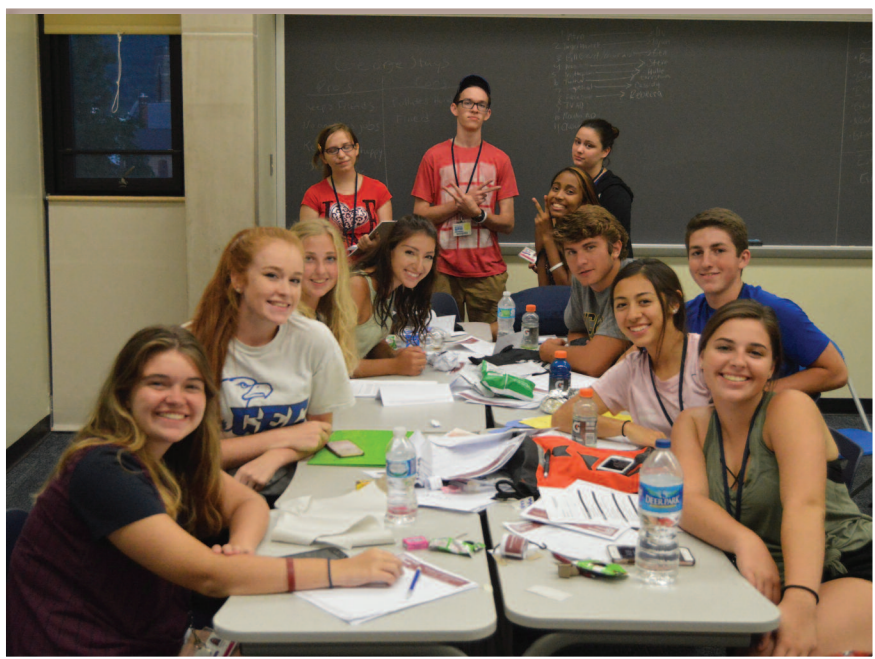
Here a 2016 student company takes a much needed break from preparing their advertising and stockholders presentations