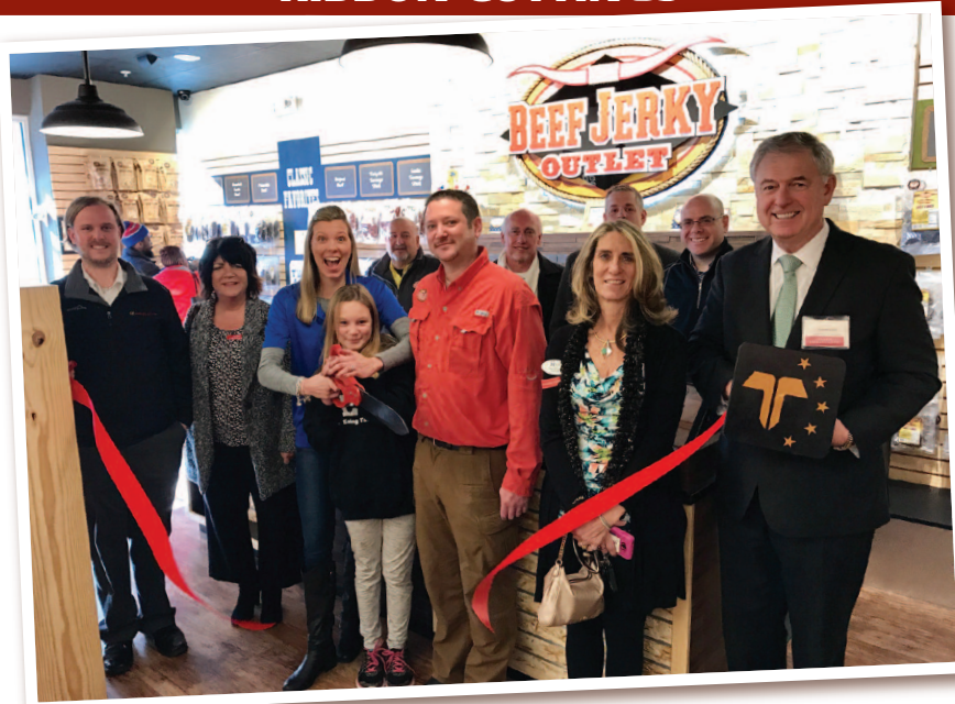
Beef Jerky Outlet,

18 W. Lightcap Rd., Suite 0885, Pottstown, PA 19464