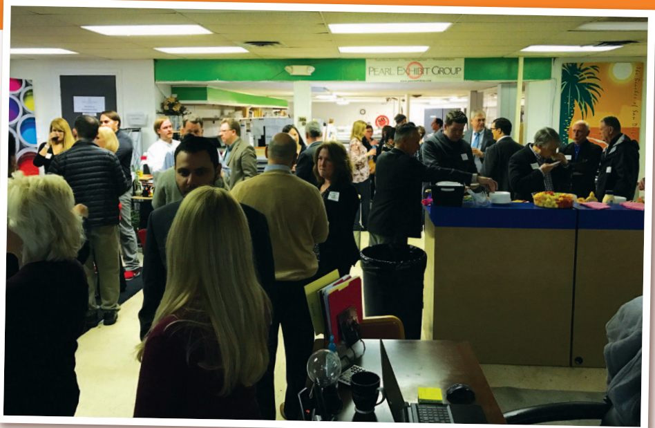
On January 24, Chamber Members gathered at Pearl Exhibit Group for the January Business Card Exchange.