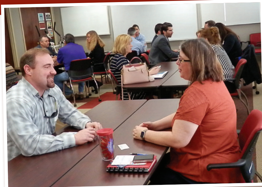
At this event, Chamber Members were able to meet every person in attendance! A group of Chamber Members looking to connect met at the Chamber Office on February 1 for Power Networking. Attendees rotated from table to table, sharing what their business has to offer with a one-minute elevator pitch.