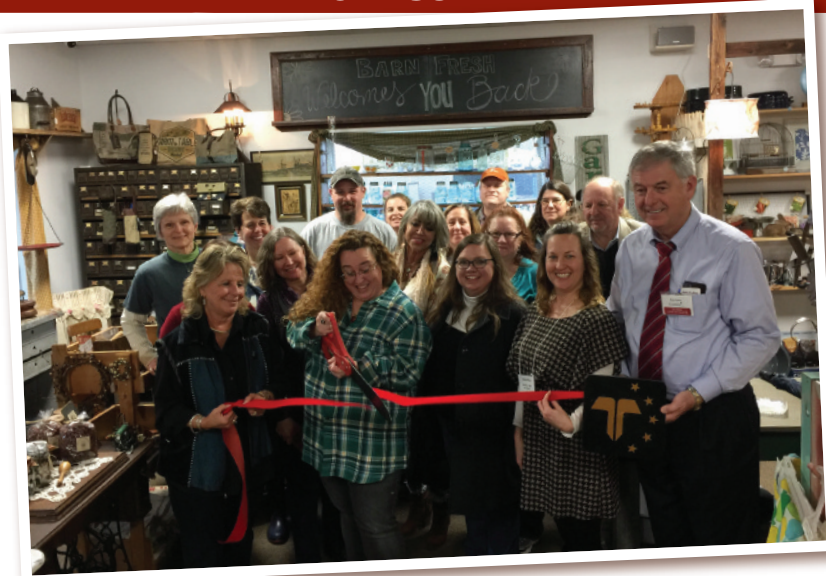
Barn Fresh Vintage Market, 311 County Line Rd., Gilbertsville, PA 19525