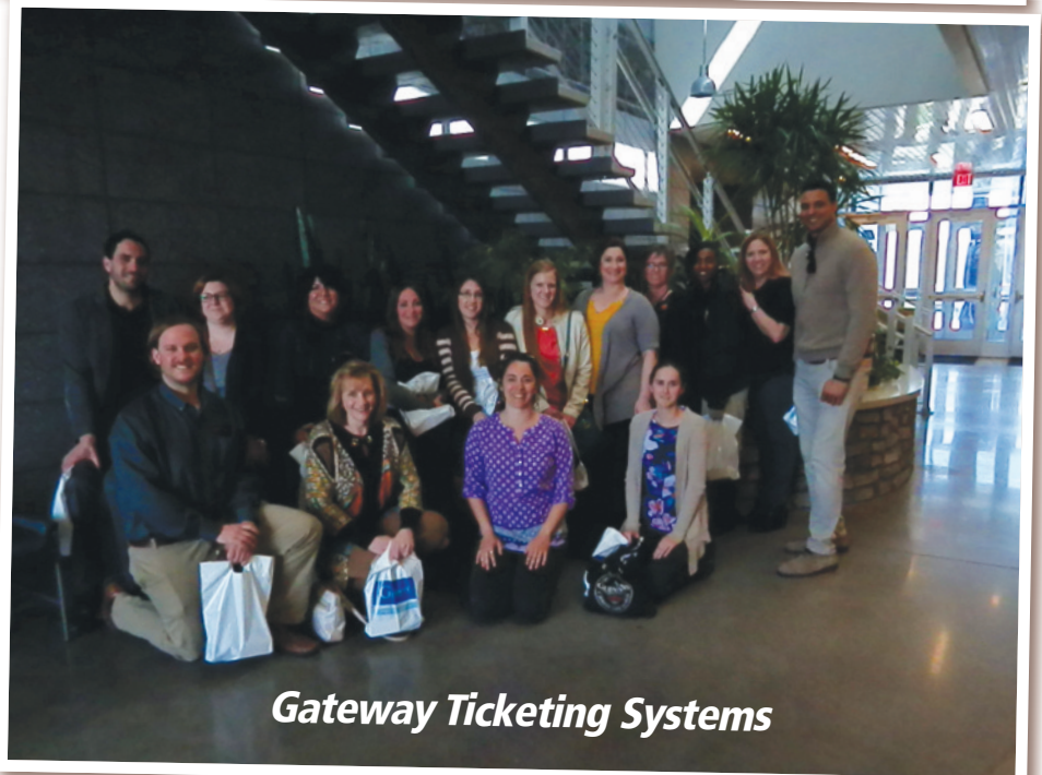
Gateway Ticketing Systems