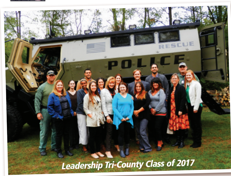
Leadership Tri-County Class of 2017

MISSION: To sustain community participation and involvement by training and providing new and emerging leaders with the expertise to serve on nonprofit boards.